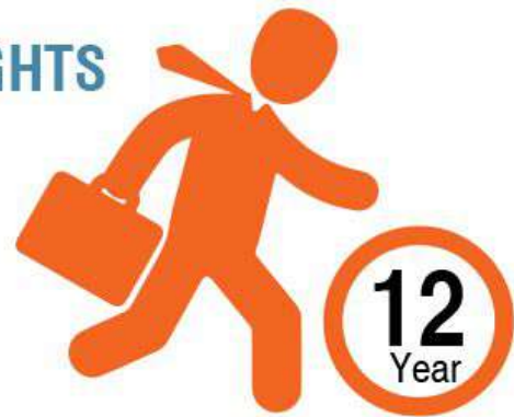
Average Work experience